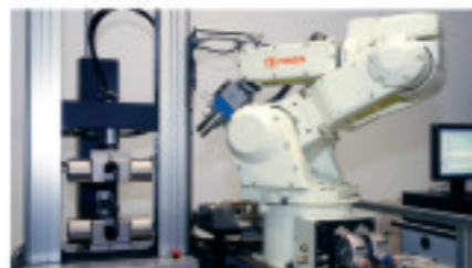
全自动电子拉伸试验机 Automatic electronic tensile tester