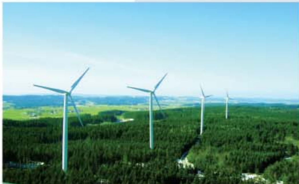
风力发电 Wind power generation