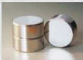
磁性材料 Magnetic material