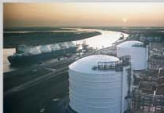
大型LNG储罐 Large LNG tanks