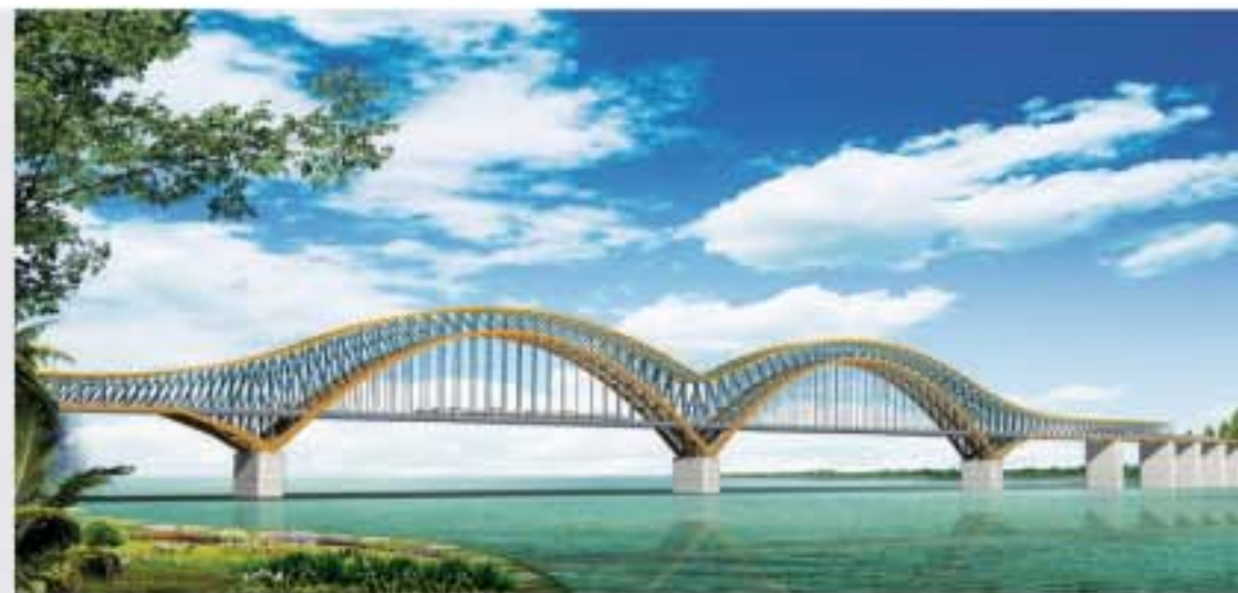
南京大胜关长江大桥 Nanjing Dashengguan Changjiang Bridge