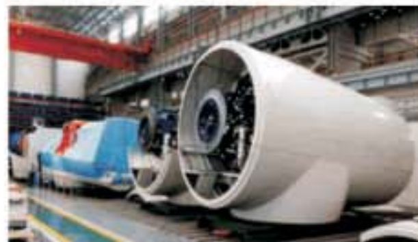
整体（机仓）总装中 Integrated (engine chamber) assembling