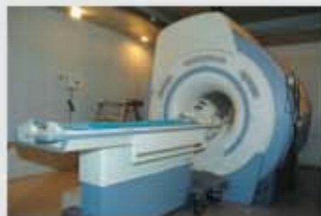
核磁共振仪 NMR machine