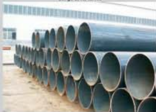
天然气管径 Natural Gas Pipeline