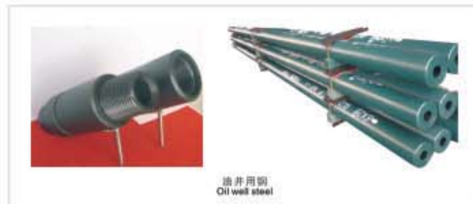
油井用钢 Oil well steel

◆ High strength, impact-resistant, good toughness; super-low magnetic conductivity, good corrosion-resistant performances