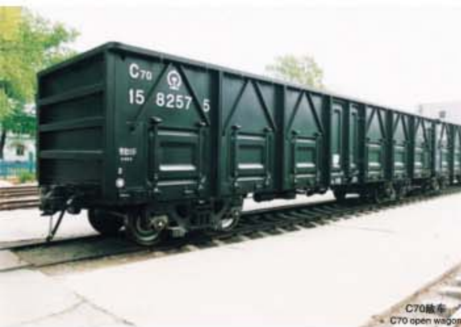
C70敞车 C70 open wagon