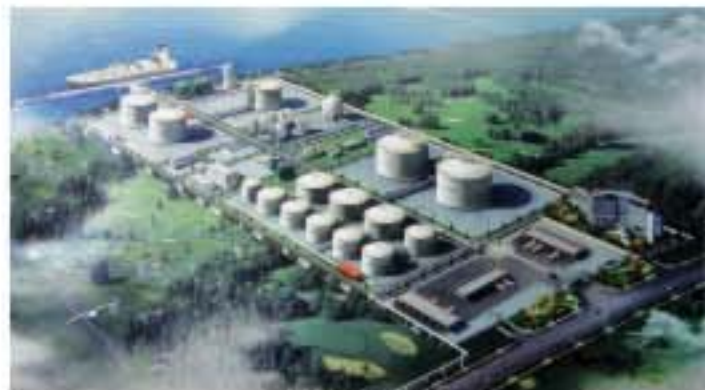
低温压力容器 Low-temperature&pressure vessel