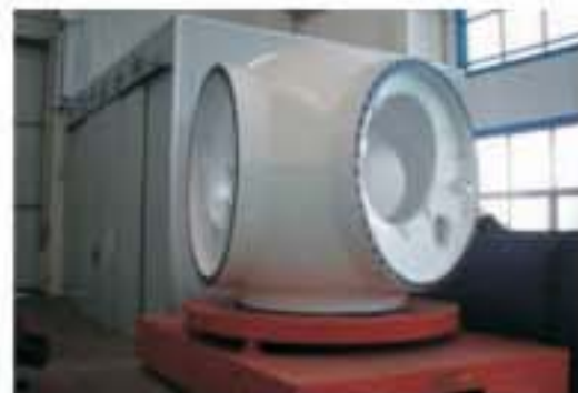
球铁轮毂 SG wheel hub