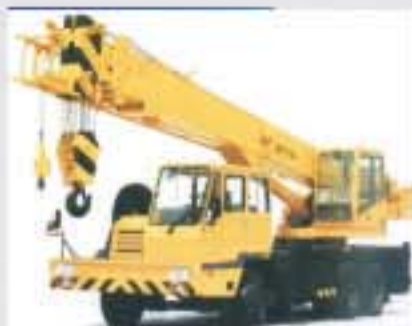
汽车吊 Truck crane