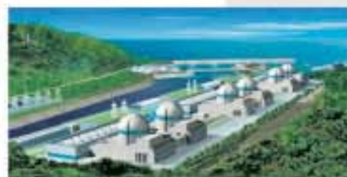
阳江核电站 Yangjiang nuclear power station