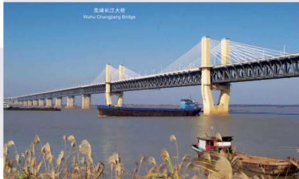
芜湖长江大桥 Wuhu Changjiang Bridge

TISCO's category and specifications of bridge steel can basically fulfill the requirements in the areas of road bridge, railroad bridge, sea flyover bridge and heavy steel structure, etc., which are applied in some of domestic bridges and port machinery successfully.