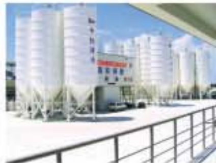
核电用结构钢 Structural steel in nuclear power station