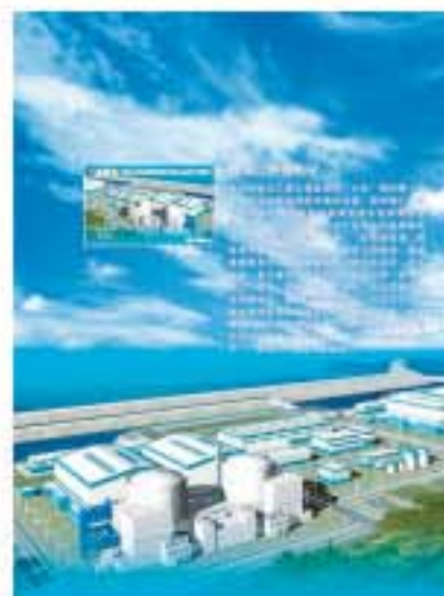
岭澳二期核电站 Ling'ao Phase II nuclear power station