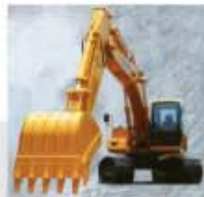
工程机械 Engineering machinery