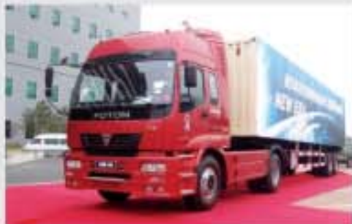
汽车用钢 Automobile steel