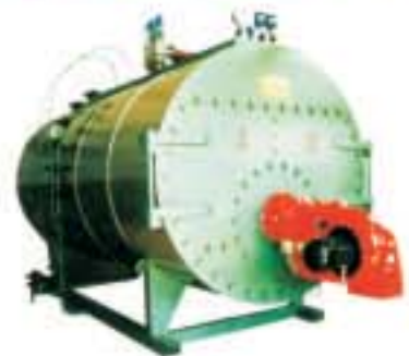
压力容器板 Pressure vessel plate