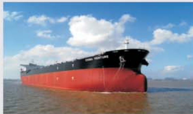
造船行业 Shipbuilding steel

太钢船体结构用钢板主要用于制造散货船、集装箱船、油轮等各种类型的船体结构和海洋石油平台、船坞以及码头设施等。目前已取得中国、英国、法国、美国、德国等五国船级社的认证。