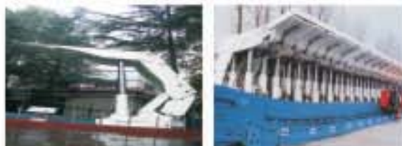
煤矿机械 Coal mine machinery