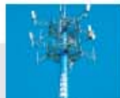
通讯塔架 Communication tower