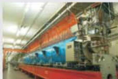
电子对撞机 Electron collision machine