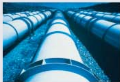
天然气管线 Natural Gas Pipeline