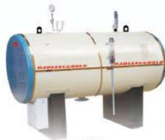
压力容器 Pressure vessel

TISCO high pressure boiler blanks are used in the making of high pressure boiler tubes, components inside power station boilers whose surface exposed to heat radiation, the water cooling wall of power station boilers, coal-saving unit, superheaters and reheaters. The seamless steel pipes made of high pressure boiler pipe blanks of T91 and T92 have been applied in the super (super) critical units of well-known enterprises, such as Harbin Boiler Plant, Shanghai Boiler Plant and Dongfang Boiler Plant.