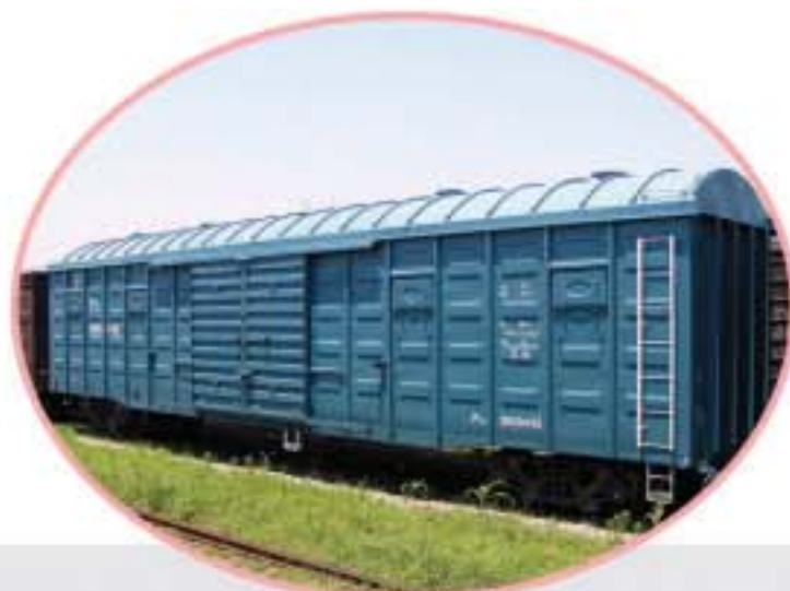
P70棚车 P70 canopy wagon

TISCO climate-resistant steel is mainly used in railway freight wagon making, including C70 open wagon and P70 canopy wagon, etc.