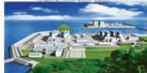
宁德核电站 Ningde nuclear power station