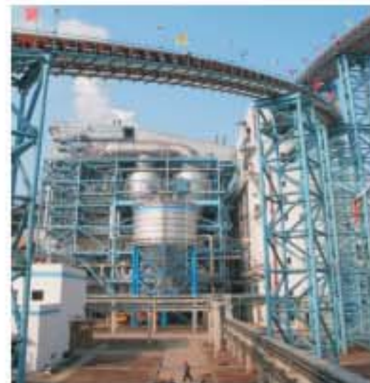
电站锅炉 Power station boiler