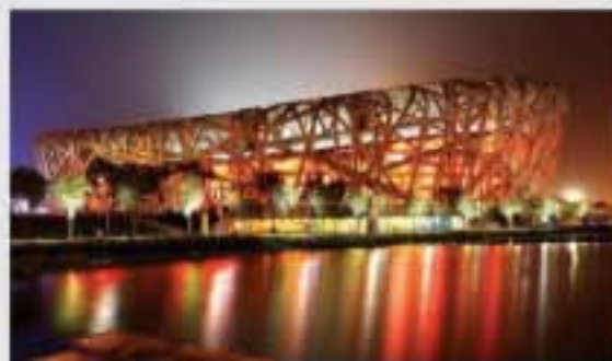
奥运鸟巢 Olympic bird's nest