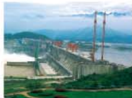
三峡水电站 Sanxia Hydropower Station