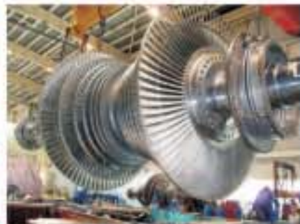
火电用钢 Thermal power steel