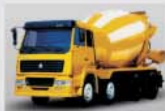
混凝土搅拌罐车 Concrete stirring tank car