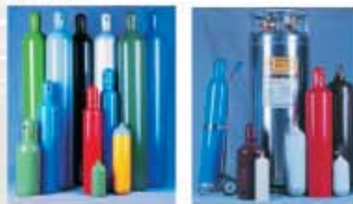
高压气瓶 High gas bottle

◆ High strength, high toughness; Fatigue-resistant, low temperature impact-resistant performance