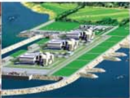
福清核电站 Fuqing nuclear power station