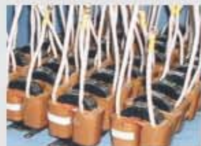
非晶中频变压器铁芯 Iron core for amorphous intermediate-frequency transformer

◆ Slab 220mm×1000mm and above×1550 mm and above, coiled bar φ 6.5-20mm, round steel φ 60-100mm×3000-6000mm, hot rolled medium-and-heavy plate 6-120mm×1000mm and above×2000mm and above, cold-rolled plate (coil) 0.5-2.0mm×900-1200mm×C, cold-rolled sheet 1.5-6.0mm×1000mm and above×1300mm and above